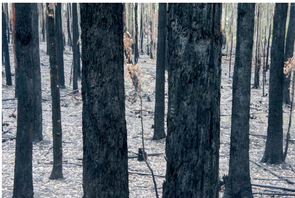
The long term impacts of fire on the Wombat's biodiversity are largely unknown.

The Victorian Bushfires Royal Commission following the 2009 Black Saturday bushfires recommended an annual 'burn target' of 5% of public land (approximately 390,000 hectares). This has since been replaced with a target of reducing bushfire risk to 70% or less. The 2017-2018 Victorian budget to 'reduce bushfire risk, refurbish forest-based assets and protect our forests and