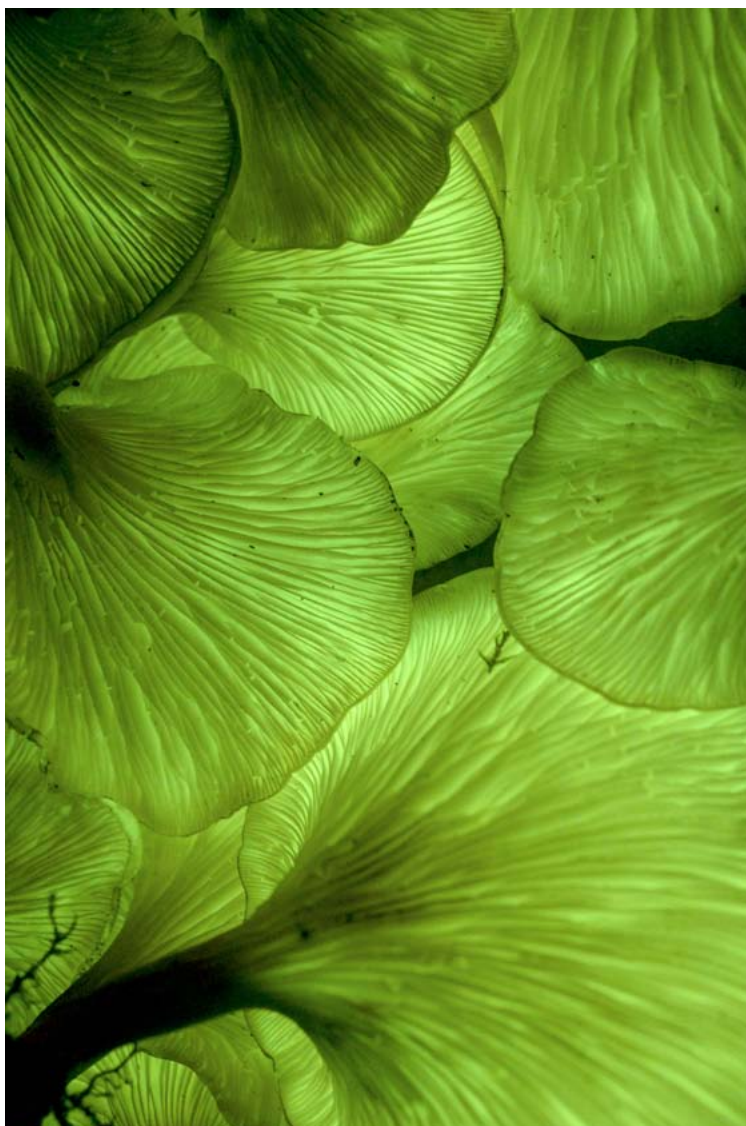
The Ghost Fungus, Omphalotus nidiformis glows a curious green.

Bioluminescence is a biological process whereby light is emitted by living organisms. The Ghost Fungus contains