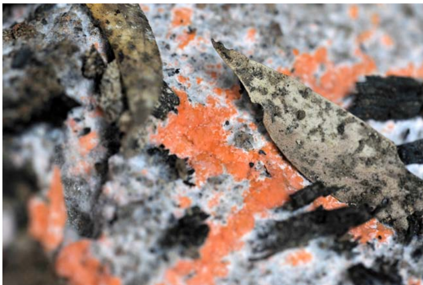
Pyronema omphalodes can appear within days of a fire and like other pyrophilous fungi, is an early coloniser of burnt habitats.

One underlying problem between fire agencies and those opposed to inappropriate burns is a misalignment of values. The extent of prescribed burning is determined by