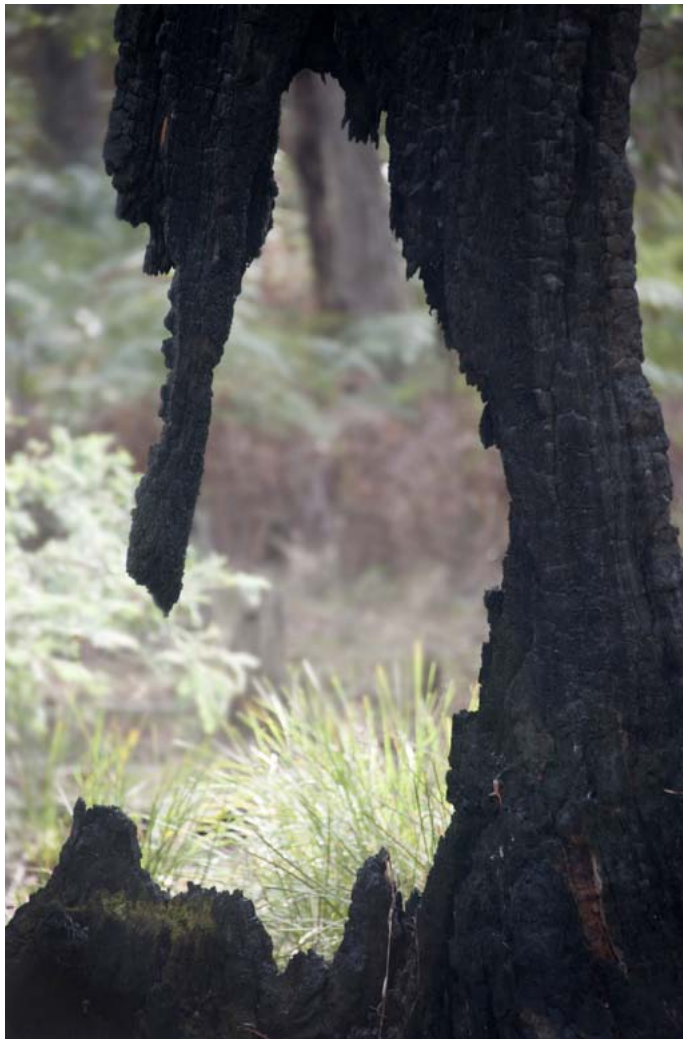
The destruction of stags (standing dead trees) through prescribed burns means the loss of vital habitat for gliders, birds and numerous other animals that rely on hollows as habitat.

topography, wind speed, vegetation type and moisture levels along with other factors. Grasslands, sclerophyll forests, temperate rainforests and other ecosystems all function in very different ways, including in their adaptations to fire. Enormous variation also occurs within the one ecosystem type. I am not a fire scientist and recognise the detailed assessments, preparation and planning necessary to determine burning regimes, yet too often it appears that burns are not tailored specifically to local ecologies, climates and situations.