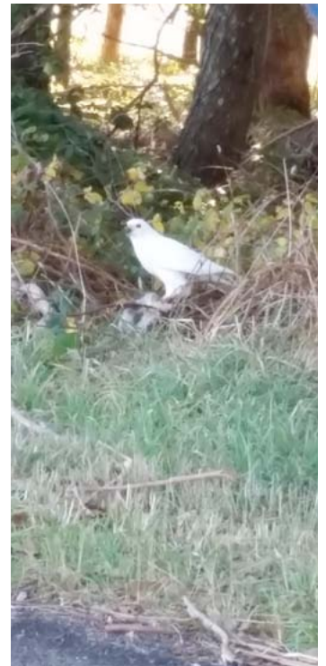
Grey Goshawk (white morph) taken on a mobile phone at Little Hampton.

*David Hollands: Eagles Hawks and Falcons of Australia