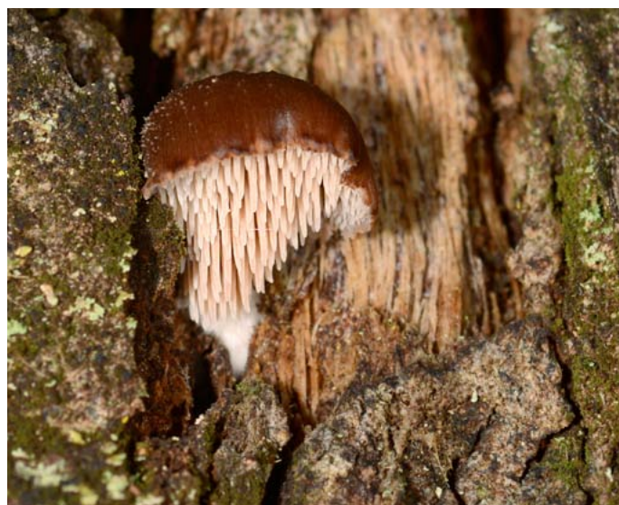
The cap of Auriscalpium sp. "Blackwood" above is only 10mm across and the largest seen in wetter years is 20mm.

search from June through to late July. I used this technique several years ago to locate a second population of the rare Sarcodon species. After identifying a site with the same conditions as the main Sarcodon location, I called in and found a specimen within 15 minutes. I have also used this technique to locate flora species in the past.