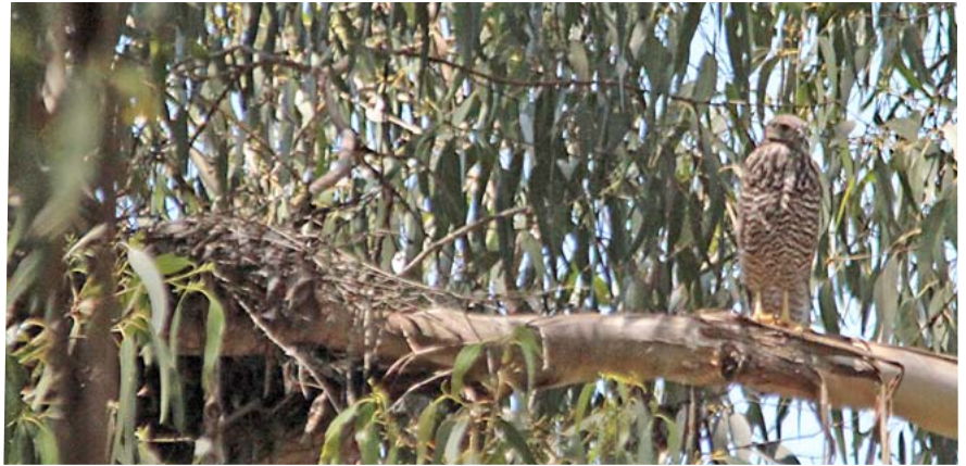
Brown Goshawk Accipiter fasciatus .

These current sightings, as well as being very exciting, also raise some intriguing questions. Is it a lone bird, or a pair, possibly breeding in or around the Wombat Forest? Although considered to be inhabitants of deep wet gullies and gallery forests, they are also known to perch high, often in white-trunked gums, on the forest edge overlooking open land. The Wombat Forest is such a large region and these birds can have extensive ranges, which makes discovery