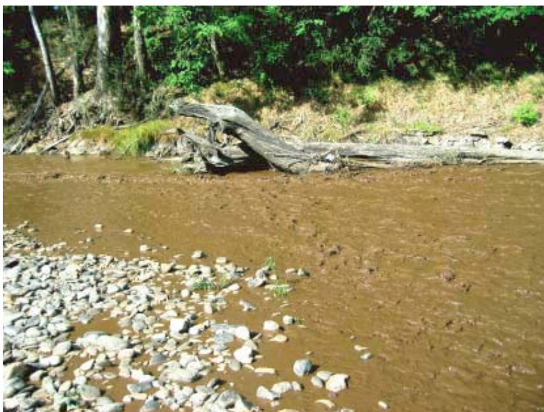
Sediment slug in the Ovens River at Whorouly 2003

Turbidity levels will vary according to the extent and duration of sediment re-mobilisation from the bed and banks of the stream and catchment sources. Once the catchment has re-vegetated and the sediment in streams has been largely removed, turbidity levels should return to pre-fire levels.