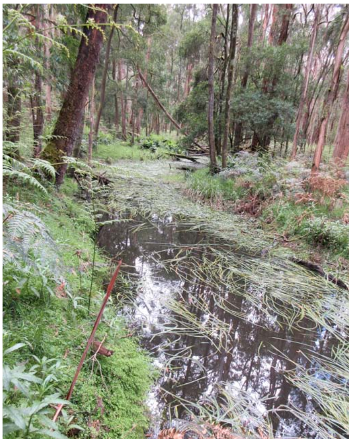
Werribee River near source in Wombat Forest.

The impacts from toxicity and low dissolved oxygen will be very short term, primarily for the period of time the initial slug of sediment and ash pass, and is likely to return to non-harmful levels in hours, if not a few days.