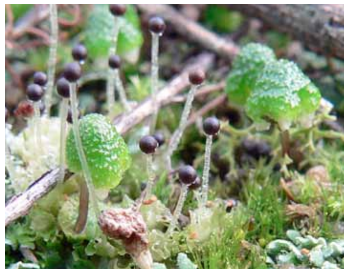
Fossombria sp. with spherical black sporophytes and the dark green sporophyte of Asterella drummondii