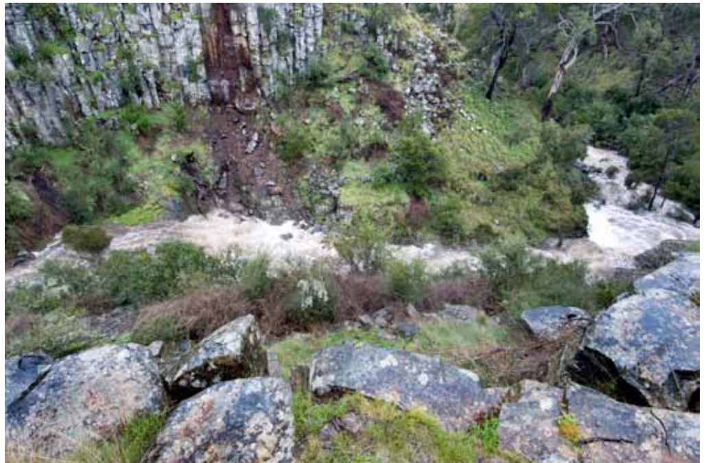
The Loddon River in high flow at Loddon Falls

The droplet soon departs the tall cool eucalypt forest and heads northward, tumbling over the basalt columns of Glenlyon Falls. It glides by platypus and native fish and further downstream traverses box-ironbark country, squeezing through the lichen-splattered boulders of Vaughan springs and onward past Guildford and Newstead. As the landscape dries out and trees become sparse, it may spend time in Cairn Curran or Laanecoorie Reservoirs, before continuing downstream to Bridgewater. Towards the