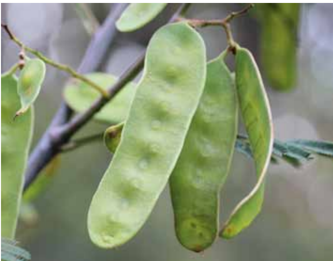
Acacia nano-dealbata seed pods

The Dwarf Silver Wattle can grow to 7 metres, which is hardly a dwarf, but the Silver Wattle can reach 30 metres. In the Wombat, however, they grow to a comparable size.