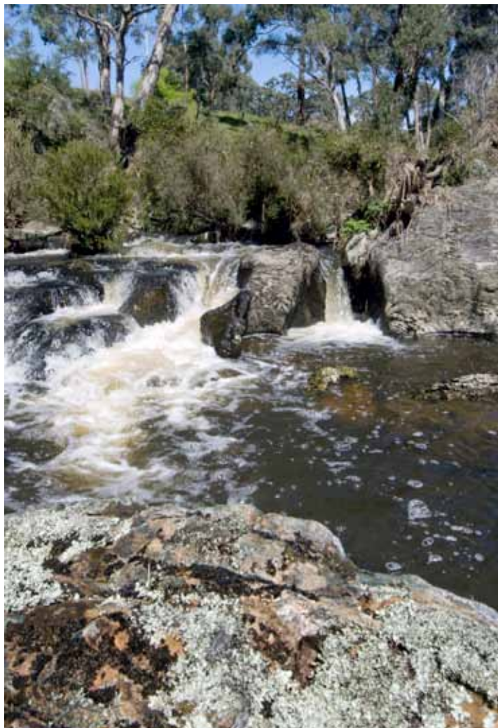
The Loddon squeezes past lichen-covered boulders near Glenluce

We know that water is precious. Water in the Wombat that rolls into the Loddon is especially precious as it supports a swag of threatened species such as growling grass frogs and powerful owls. The Loddon catchment was once a supply of water, fish and other fauna for the Dja Dja Wurrung and other Aboriginal peoples. They inherently understood this environment and were inseparable from the land. From their connectedness, we can begin to understand their belonging and responsibility for the natural environment. And from this, we too can learn how