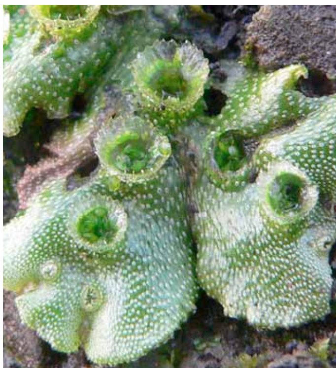
Marchantia berteroana gemmae cups with their distinctive crowned top and bundles of eggs within.