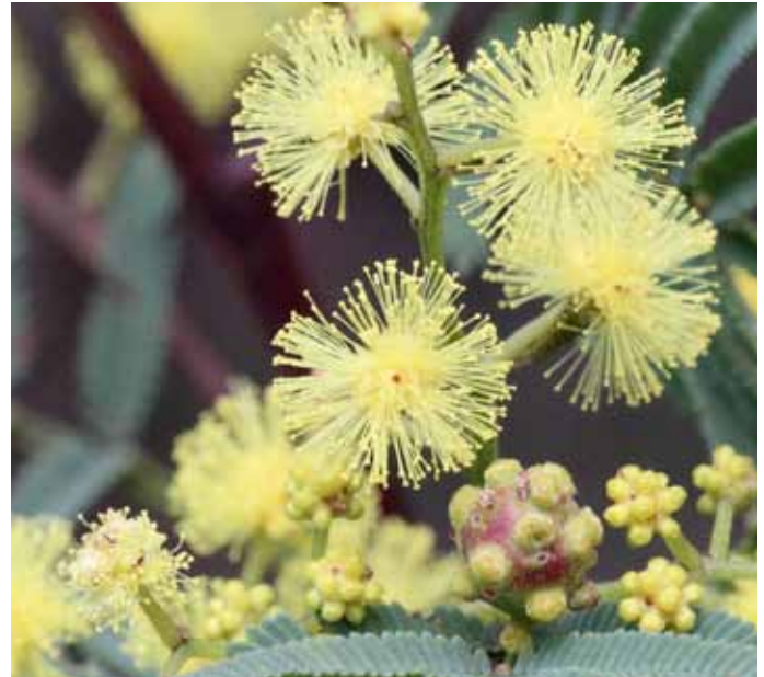
Acacia nano-dealbata flowers

A population of the less familiar Dwarf Silver Wattle ( Acacia nano-dealbata ) is recorded for Bullarto on some roadsides. This wattle which is listed as “Rare in Victoria” is endemic to our State.