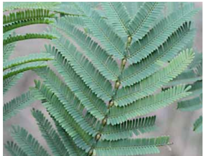
Acacia nano-dealbata foliage

The seed pods of the Dwarf Silver Wattle are quite large and a distinctive oblong measuring about 7 x 1.5 cm. The flowers are a slightly brighter yellow and the shrub-tree somewhat bushier.