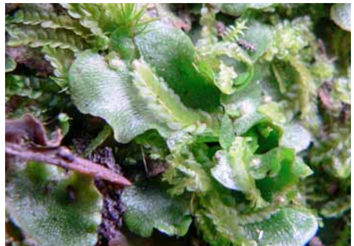
An unidentified leafy liverwort, probably Chiloscypus semiteres , scrambling over the much larger thallose species, Lunularia cruciata