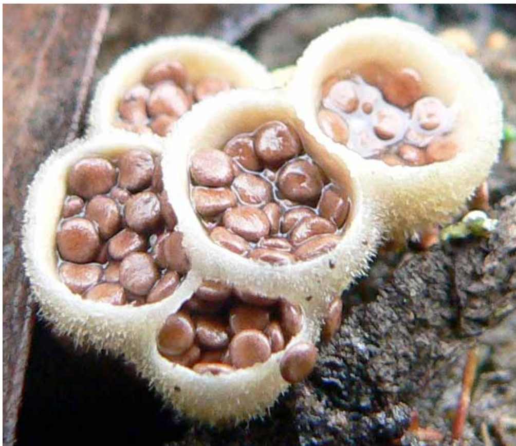
Jellied Birds-nest Fungus ( Nidula niveotomentosa )

With summer coming on you may think it is a bit late to see some of these interesting plants in the Wombat but keep your eyes peeled around damp areas, creeks and streams and you just might be rewarded with the sexual antics of the humble liverwort. ■