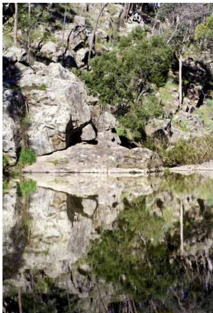
Reflections on the Loddon south of Vaughan Springs

Aquatic connections - In previous articles I've lamented the loss of human connection with the environment. This disconnection often stems from the tendency to view humans as separate from 'nature'. Our current day approach to water, to water markets, to water trading, to water as a commodity, is a prime example of this rift. It seems, strangely, that many also view water as separate from the environment. Yet surely we're all fully aware that this