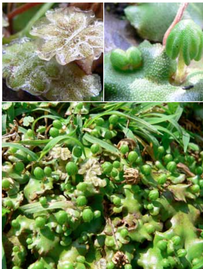
Marchantia berteroana Top Left - antheriophore containing antheridia, Top Right - immature archegoniophore, Bottom - group of both male and female plants showing older dried brown archegoniophores

Now I did state at the beginning that liverworts do it both ways. It seems the dizzying heights reached by the Marchantia 's sperm during sexual reproduction isn't enough as these little plants also reproduce asexually. In fact all the bryophytes can reproduce asexually. The Marchantia species produce a special kind of splash cup called a gemmae cup which looks a lot like a small nest full of eggs. Each egg is actually a small piece of gametophyte and raindrops break the connection