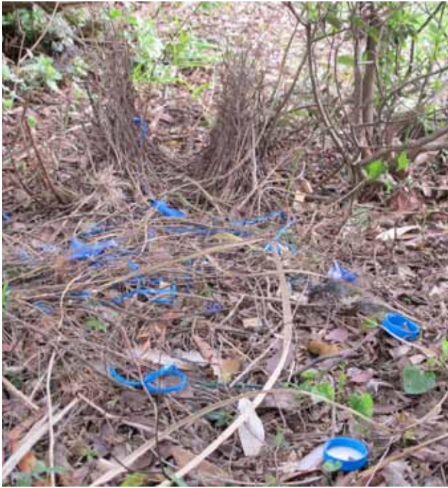
The bower and the court

Stevie has no patches of blue-black in his plumage, which places him in the second to fifth year age class. However, his bill is the same colour as an adult male, which means he is probably in the five year old age class. It is difficult to be sure, as there is some variation in age when males attain adult plumage.