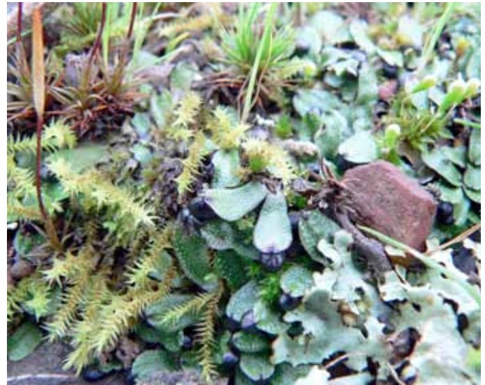
Targionia hypophylla , a thallose liverwort with its characteristic black clog-like capsules in a typical bryophyte garden. There are at least six moss species, one leafy liverwort and one lichen also in the photo - photography © John Walter

The recent visit to the Stewarts Creek Hydrological Experimental Area by the group provided me with an ideal opportunity to capture the life cycle of another thallose liverwort, Marchantia berteroana . The thallose