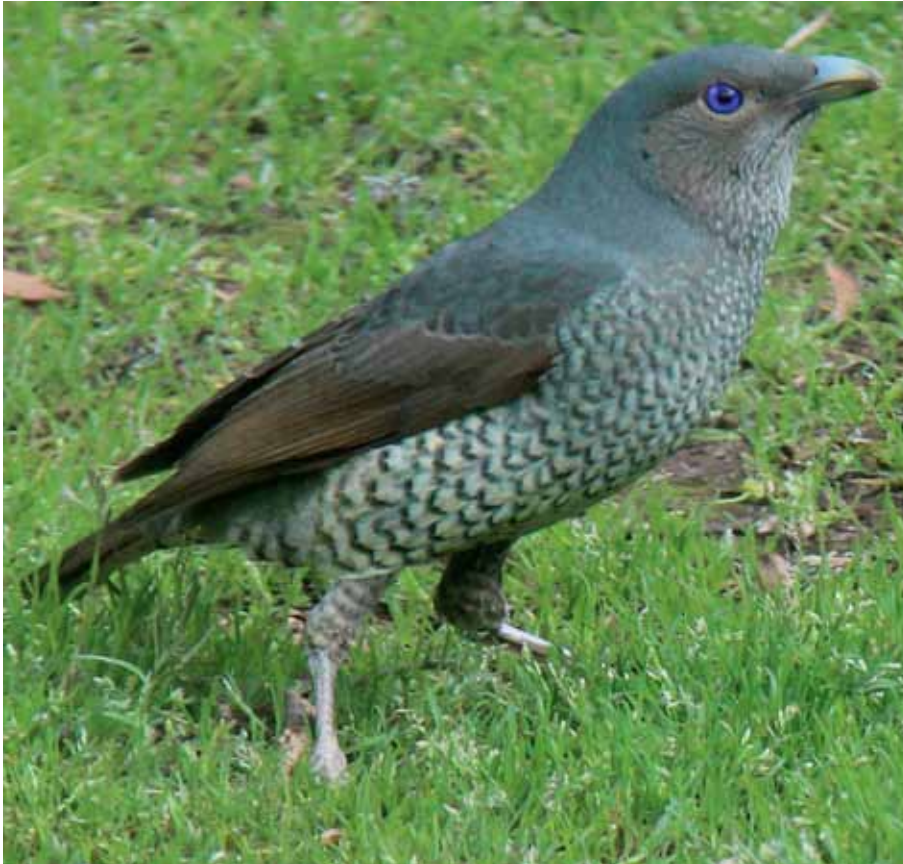
Satin Bowerbird ( Ptilonorhynchus violaceus )

A young male Satin Bowerbird has constructed a stunning avenue bower in suburban Trentham, complete with a dazzling array of blue objects such as feathers, flowers and bottle tops. The young male tends to his bower and his court with meticulous attention, and performs special displays involving song mimicry, metallic buzzing and some very athletic looking 360 degree turns.