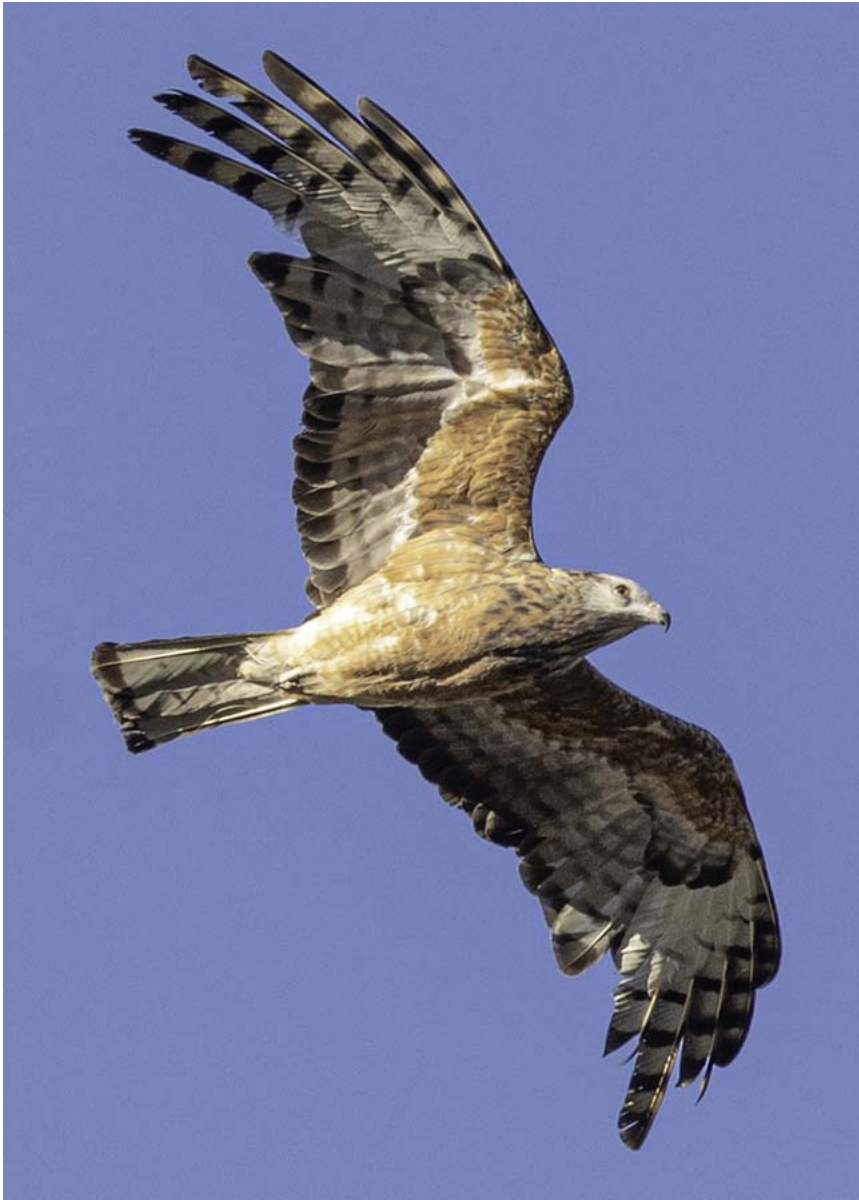
Square-tailed Kite (adult), Rise and Shine Bushland Reserve, New Year's Day 2019.

of these birds. It is wonderful to think that our local kites may have overwintered as far away as the Kimberley ranges in Western Australia, and then flown all the way to these foothill forests to breed.