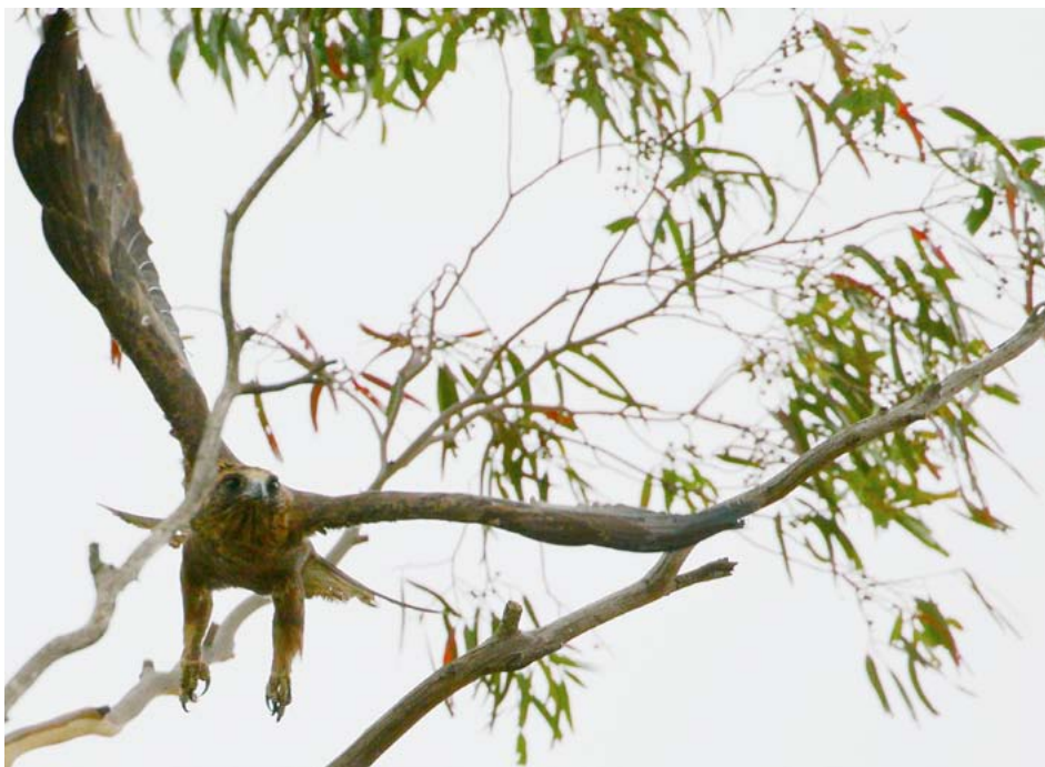
Little Eagle in flight at Kangaroo Hill, Denver, January 2021.

native trees, protection of remaining native woodlands, remnant trees and grassland is critical in providing adequate foraging and breeding habitat for this species.