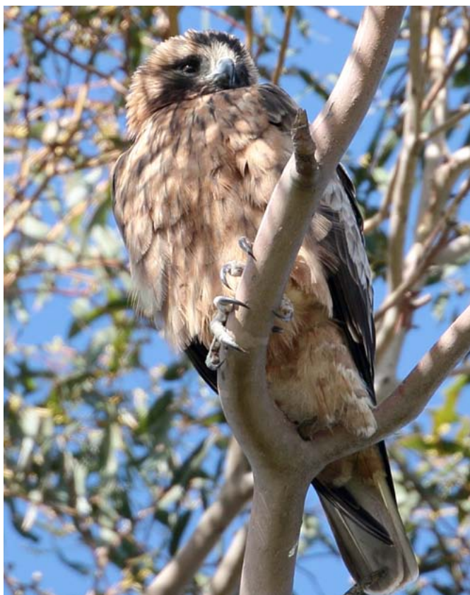
Little Eagle Kangaroo Hill, Denver, June 2020.

Secondary poisoning from anticoagulant rodenticides