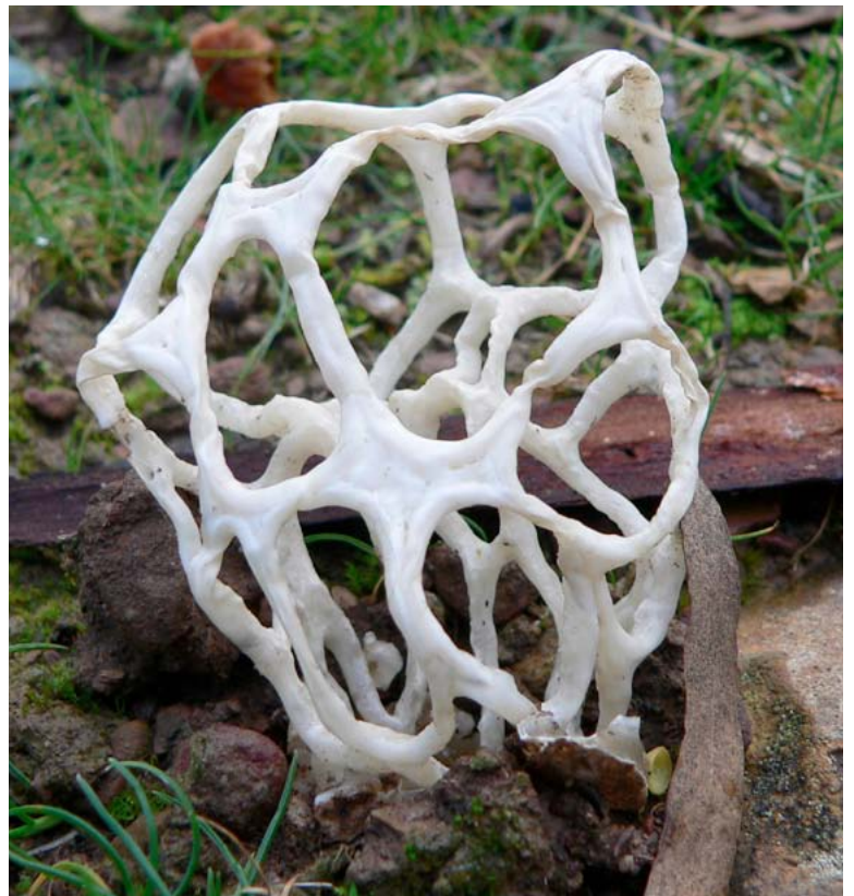
An older specimen of I. gracile with the gleba removed.