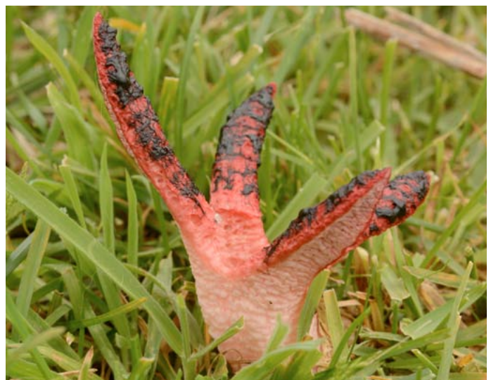
Top two images: Clathrus archeri (also known as Devil's Fingers) viewed from above and in profile. The gleba covers the length of each finger.