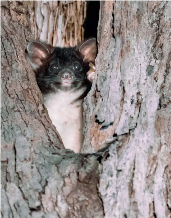
Young Greater Glider Petauroides volans .

The State of Victoria continues to add to its long list of threatened species; recently the Platypus and the Little Eagle, and with the 2019-20 fires, the need to reassess the vulnerable status of the Greater Glider Petauroides volans . Should they now be considered Endangered or even Critically Endangered?