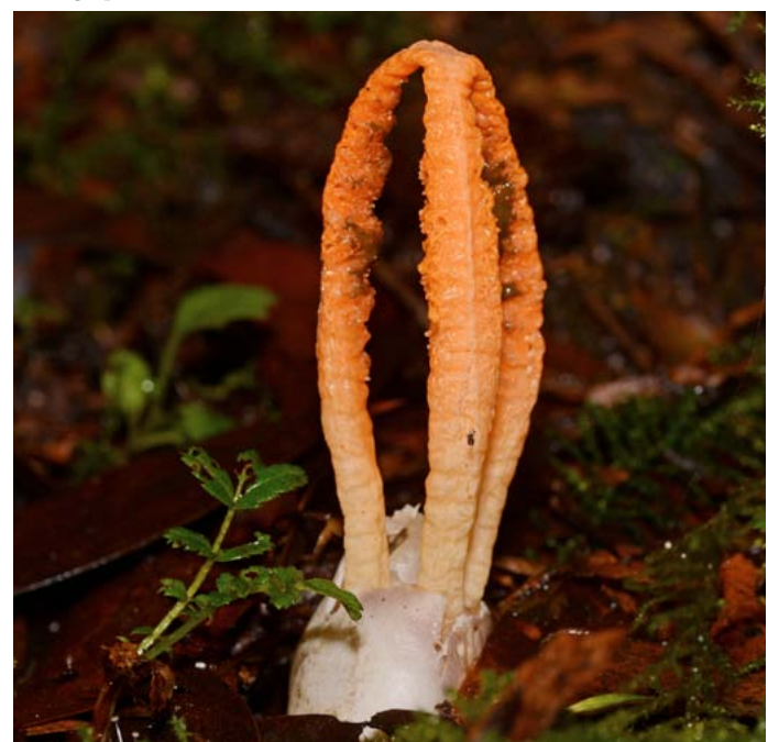
Below: Pseudocolus fusiformis (also known as Stinky Squid).