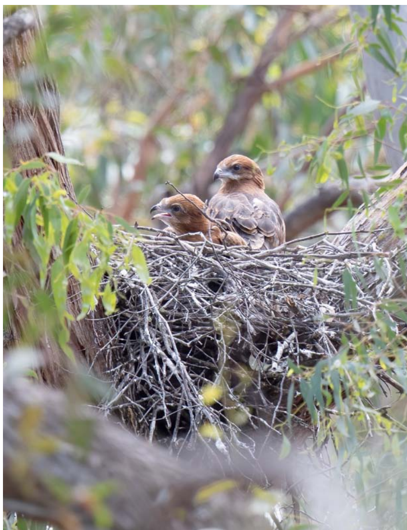
Juvenile Square-tailed Kites in nest.

Many birds of prey, such as Wedge-tailed Eagles or Brown Falcons will take a variety of prey items, from rabbits to insects to pigeons to carrion, such as road kill; the Square-tailed Kite is a specialised predator of nestling birds. They hunt slowly and efficiently, flying backwards and forwards, soaring and scanning the tree canopy