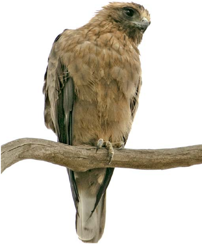
Little Eagle photographed at Kangaroo Hill, Denver, January 2021.

In January 2021, yet another two species were officially recognised as Vulnerable to extinction under Victoria's Flora and Fauna Guarantee Act 1988 (FFG Act). One of these species is the iconic Platypus Ornithorhynchus anatinus . The other is one of our not-so famous eagles, the Little Eagle Hieraaetus morphnoides . This species is already listed as threatened under legislation in South Australia, New South Wales and the ACT.