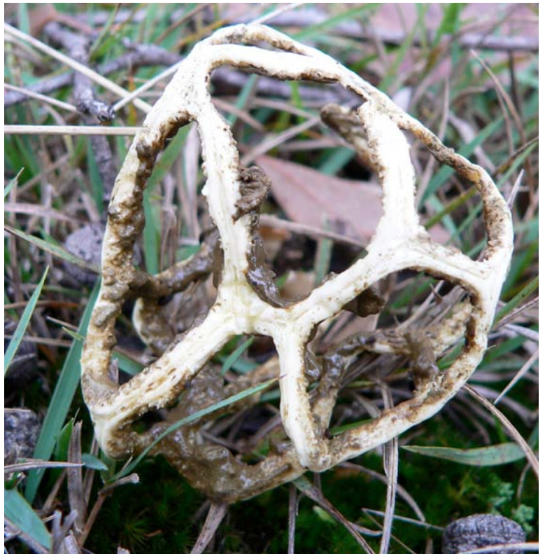
A fresh specimen of Ileodictyon gracile (also known as White Basket fungus) with the gleba coating the inside of the cage.