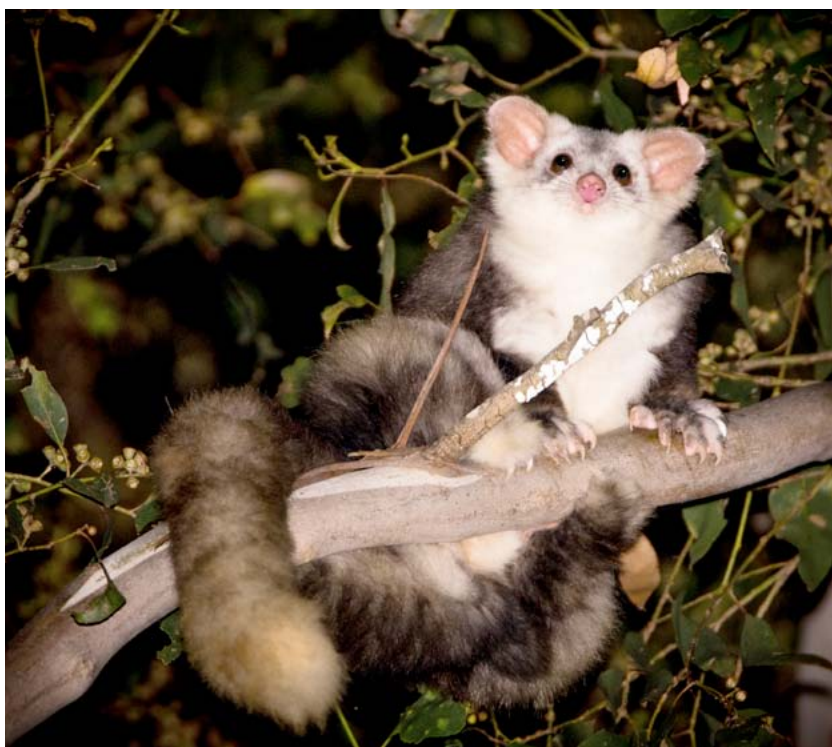
Greater Glider Petauroides volans .

We are at a loss to understand how this can be, because if scientific data is not being collected how can “the long-term impact of fire management practices” be measured. We contacted Melbourne University and were informed that their scientist is only studying tree growth.